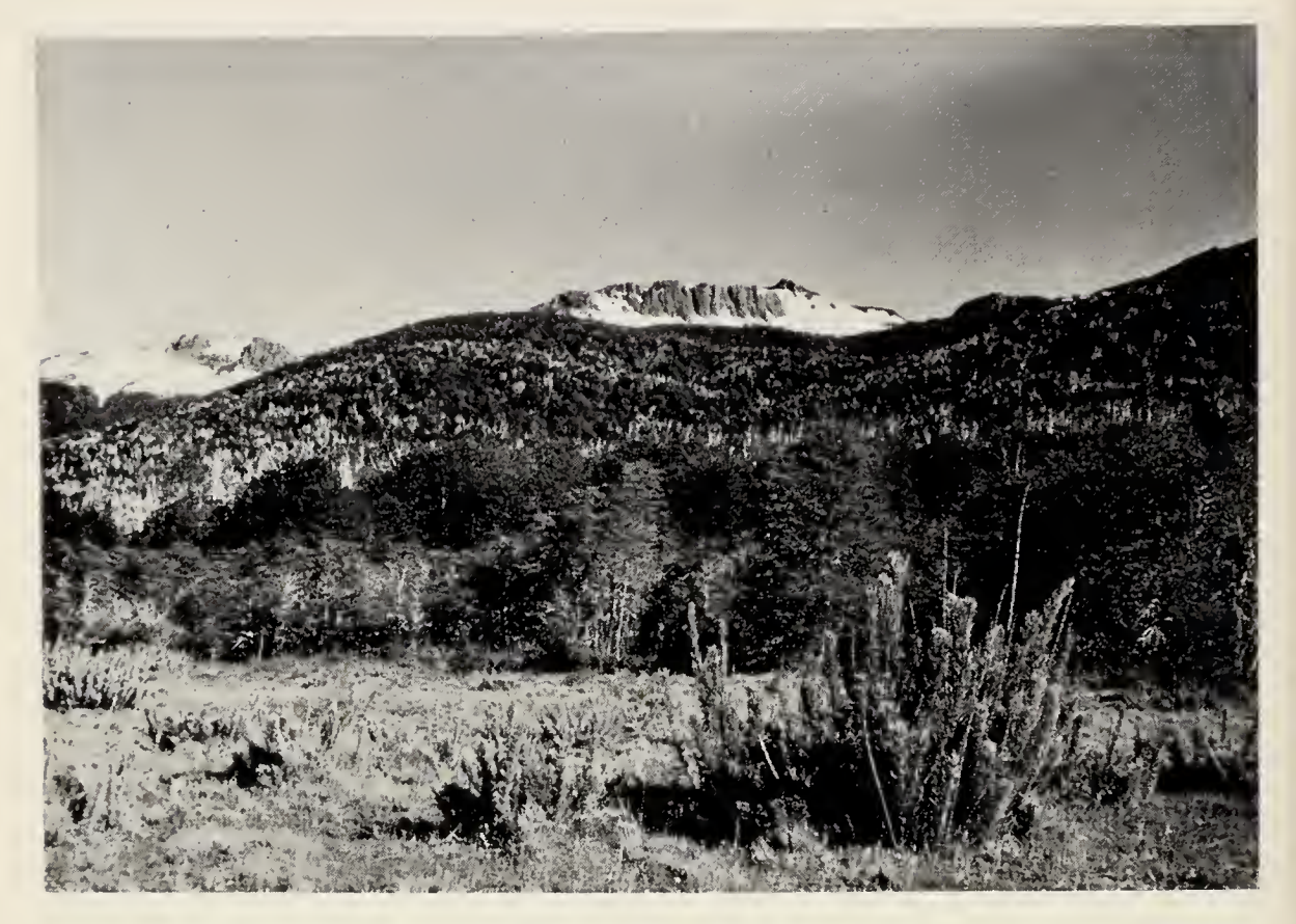
FIG. 5. Edge of mature Nothojagus forest northeast of Lake Lolog, 18 kilometers north of San Martín de los Andes, Neuquén. Magellanic Woodpeckers were abundant in this forest (see text). Note the dead tops of many trees on the slopes. Cattle were pastured in the foreground (where scattered bamboo clumps are seen), but not in the forest itself.